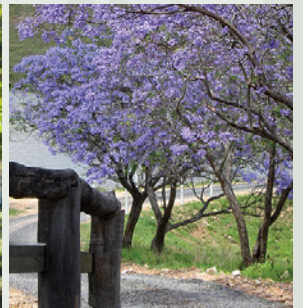
TREE-LINED DRIVEWAY: In late spring the jacaranda trees come alive with impressive purple blooms.